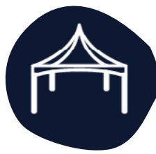
TENTS & MARQUEES