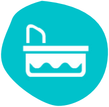
LINERS & COVERS