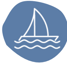
MARINE & AUTO